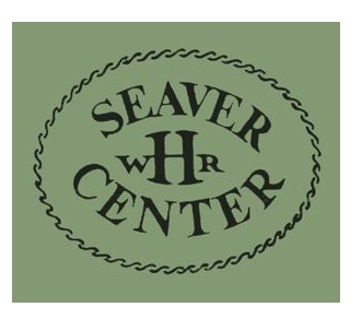
Plan your research visit