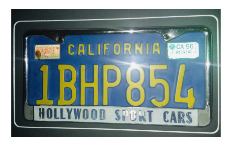
TR8 Number Plate