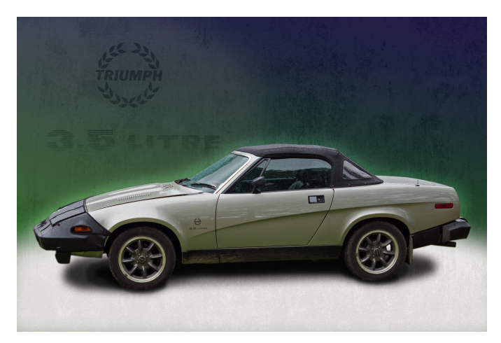
Car photo taken during a Royal Australian Flying Doctor Service fundraising event