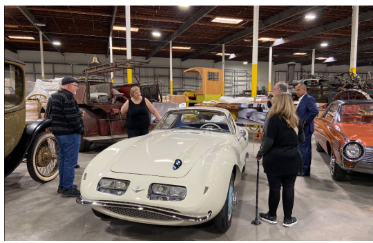
On view is the Raymond Loewy BMW 507 built in 1957.